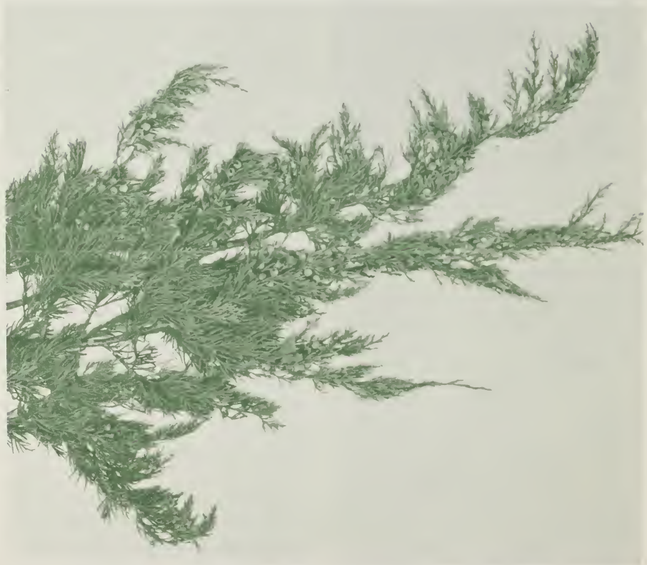
Eastern redcedar. (About one-quarter natural size)